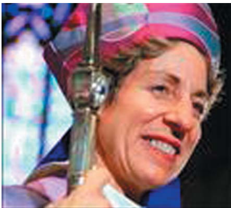
The Most Rev. Dr. Katharine Jefferts Schori, Presiding Bishop and President of the Executive Council of the Episcopal Church.

On Sunday, October 28, The Executive Council of the Episcopal Church and our Presiding Bishop, the Most Rev. Dr. Katharine Jefferts Schori, will join us for worship during their fall meeting, October 16–28, at the Dearborn Hyatt-Regency Hotel. The Presiding Bishop will preach and celebrate that day at our 10 AM service. Though we will attempt to present our guests with as normal an experience of our worship community as possible, there is talk about a live web broadcast of our worship.