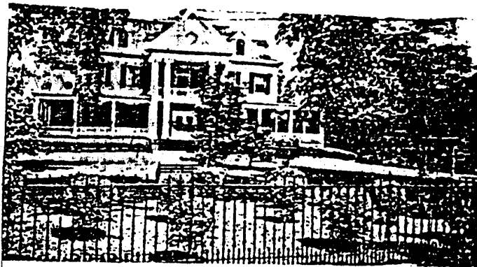
The Community Center—formerly the residence of Governor Phineas E. Lounsbury